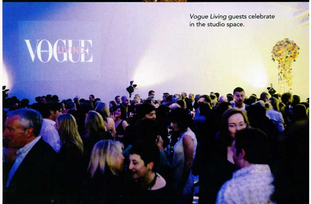
Vogue Living guests celebrate in the studio space.