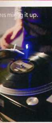
...res mixing it up.

Vogue Living threw a stylish party to celebrate 40 years in publishing. Here's a quick snapshot.